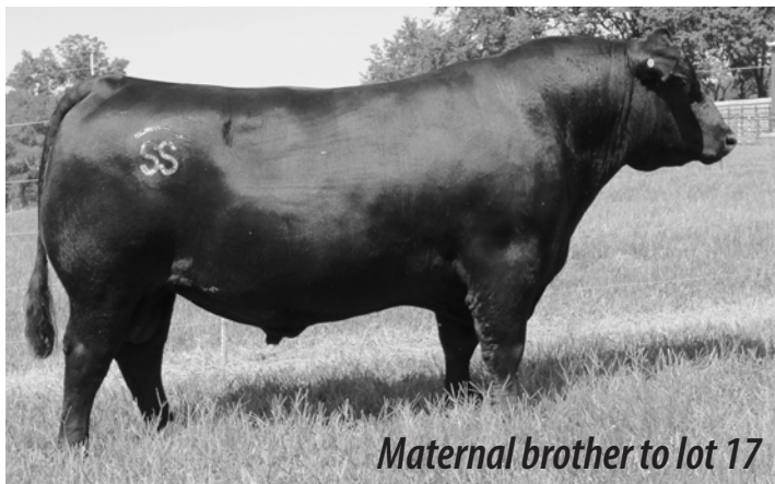
Maternal brother to lot 17