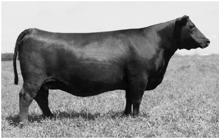
Lucy S S E82 - dam of lot 1