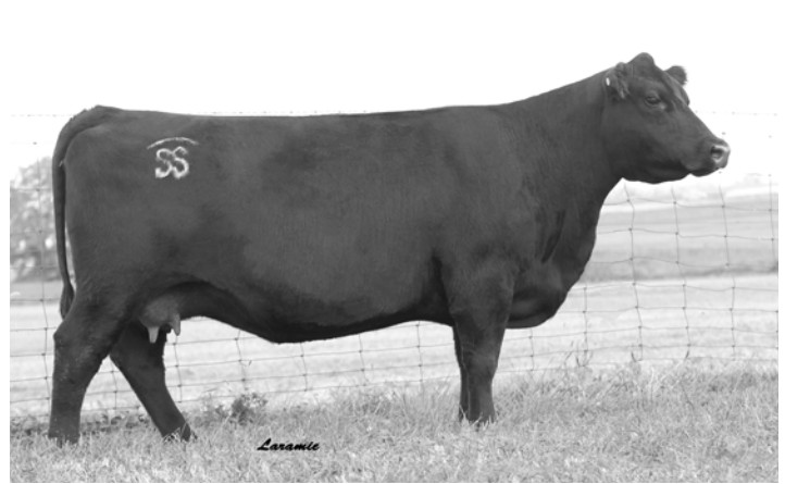
Lucy S S B60 - granddam of lot 1 and dam of lots 2 & 3