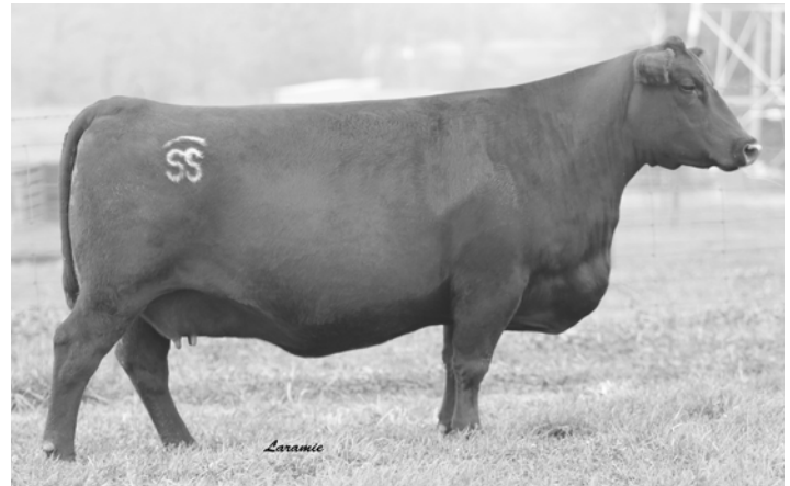
Eventress S S Y65 - dam of lots 4 & 5

Dams Production BW 6-102 WW 6-106 YW 6-102 %IMF 1-297 RE 12-101